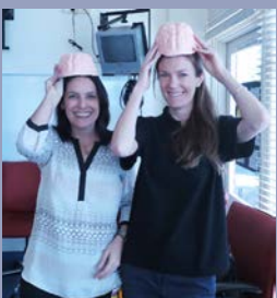
Page 3: The Tweed Hospital Acute Stroke Unit opens