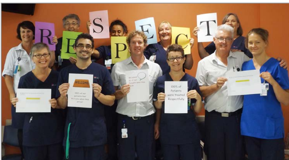
Staff of Lismore Base Hospital Endoscopy Unit focussing on patient-centred care through respect.

Patient stories provide critical information about the health care setting from the patient's perspective, as these patient's comments indicate: